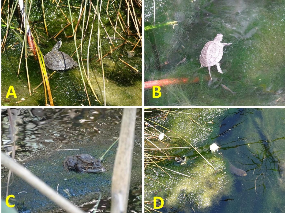
Figure 2. Other syntopic species inhabit in study site; Mauremys rivulata (A-adult, B-juvenile); Pelophylax bedriagae (C); Anguilla anguilla (D).

In 2019, an adult female Red-eared slider turtle was captured and measured, then preserved in the Collection of Zoology Research Laboratory, Ç.O.M.U. Morphological measurements were taken as Straight carapace length= 163.4 mm, carapace width= 122.88 mm, carapace height= 63.32 mm, plastron length= 147.11 mm, plastron width= 101.78 mm, humeral suture length= 12.47 mm, pectoral suture length= 15.72 mm, abdominal suture length= 43.65 mm, femoral suture length= 16.24 mm, anal suture length= 31.49 mm.