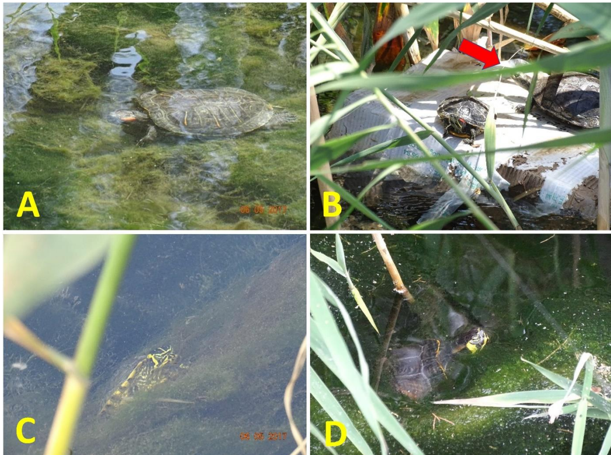
Figure 1. Observed slider turtles in the study site. Trachemys scripta elegans (A-B) and T. s. scripta (C-D). The red arrow indicates the native freshwater species Mauremys rivulata .

During the field studies in 2017, sub-adult specimens of T. scripta were observed and photographed. Regarding subspecies status, one of the observed specimens belonged to Red-eared slider T. s. elegans , and the other belonged to the Yellow-bellied slider T. s. scripta . In the following field surveys, specimens of both subspecies were re-observed. Besides, one of the native freshwater turtle species, Mauremys rivulata (Valenciennes, 1833), was also observed with slider turtles in the same habitat (Figure 1). Other syntopic species observed were the Levant water frog Pelophylax bedriagae (Camerano, 1882) and European eel Anguilla anguilla (Linnaeus, 1758) (Figure 2).