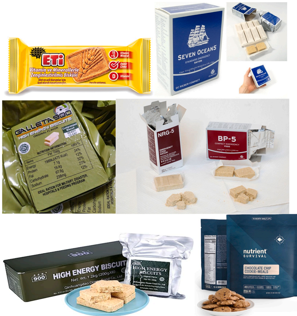
Fig. 2. Emergency/Survival Food Biscuits and cookies (Anonymous, 2023a, b).

intermediate moisture should be preferred. In addition, some innovative products can be preferred in this context. Examples include powdered products that can be easily prepared with hot or cold water and meet the nutritional needs of a person (Cisneros-Garcia et al., 2023). However, although such products meet nutritional needs, they do not fulfil psychological needs. as an example Şimşek et al. (2019) stated that foods such as fresh fruit offered to disaster victims can improve people's well-being.