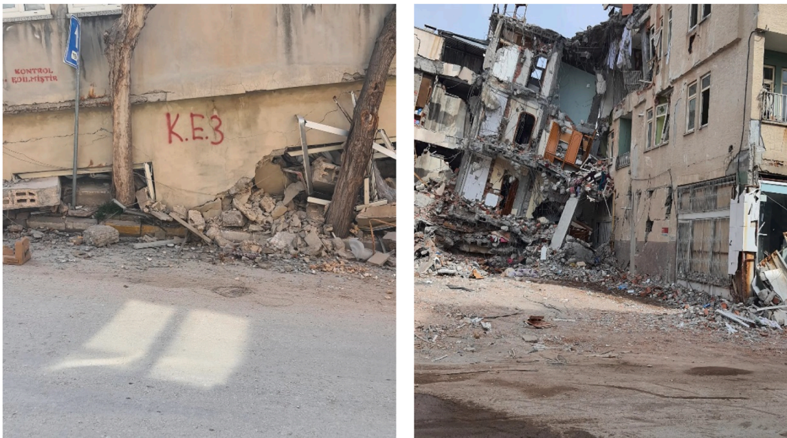
Fig. 1. Pictures taken in the centre of Adıyaman city after the earthquake (Aydın, 2023).