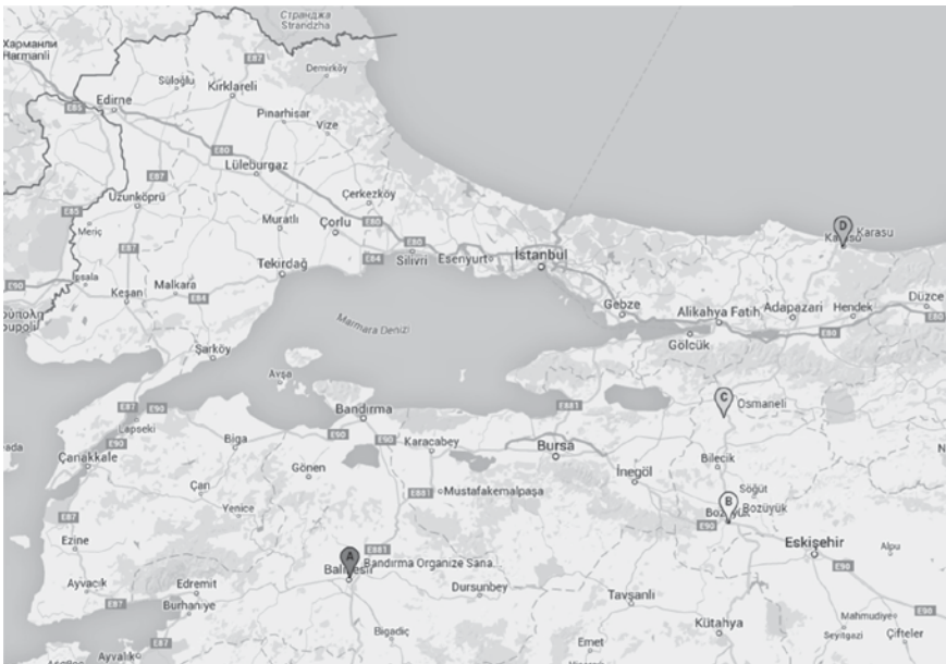
Figure 1. Location alternatives of the problem

In our facility location selection problem there are 6 criteria, 38 sub-criteria and 4 candidate location namely Balıkesir Bandırma Organized Industrial Zone, Bilecik Bozüyük, Bilecik Osmaneli and Sakarya Karasu. Interviews for filling pairwise comparison surveys were done with the general manager, marketing manager, sales manager, logistics manager, export manager, finance manager and production manager in order to determine criteria weights. All criteria in the selection of facility location are determined by literature review and experts in this Plastic Goods Manufacturing Company. 6 criteria with 38 important sub-criteria to be used for facility location selection are identified. These 6 main criteria are as follows: “Physical Facilities” (A), “Infrastructure for Production” (B), “Logistic Facilities” (C), “Cost” (D), “Strategic Facilities” (E) and “Proximity to Production Factors” (F). Decision hierarchy is shown in Table 2. The aim of the decision (the selection of the optimal facility location), the criteria, sub-criteria and alternatives structure the four levels in the decision hierarchy.