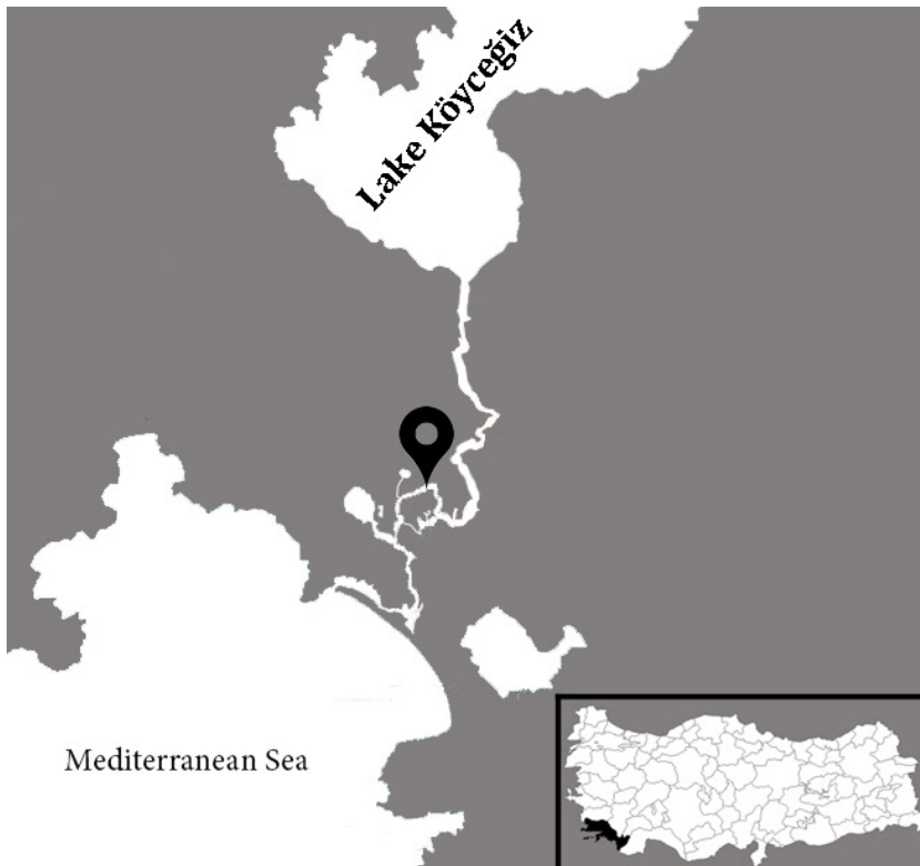
Figure 2. Map of the Turkish study area. Location of the Köyceğiz–Dalyan estuarine channel system in Turkey.

anticoagulant (after centrifugation) for the assessment of biochemical parameters (aspartate aminotransferase, AST; alanine aminotransferase, ALT; alkaline phosphatase, ALP; lactate dehydrogenase, LDH; serum total protein, TPROT; albumin, ALB; glucose, GLU; total cholesterol, CHOL; and triglycerides, TRIG).